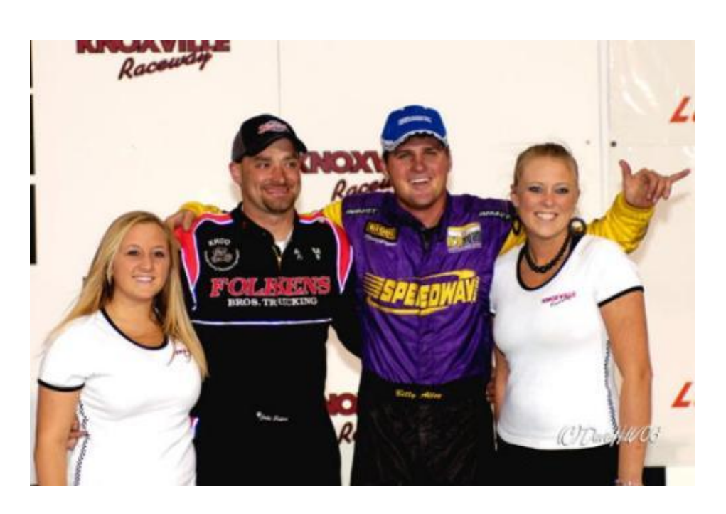
2006 410 Final Point Standings and Feature Winners: